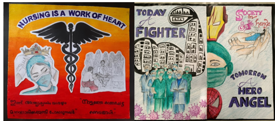
SNA Zonal E- poster Competition Second Prize