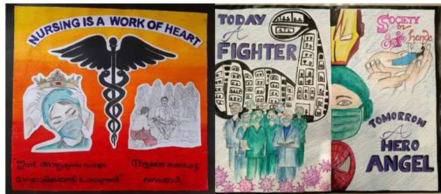
SNA Zonal E- poster Competition Second Prize

EXTRAVAGENZA KIMS CON has an energetic SNA & NSS unit to outburst the students talents. Our students had participated in various zonal & state level competitions and bagged prizes.