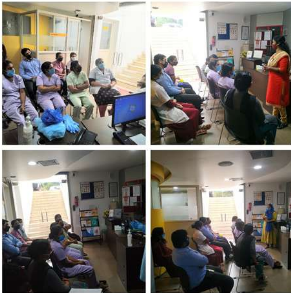
Health promotion awareness to KIMS wellness centre, Kuravankonam , Trivandrum

KIMS CON, faculties conducted an awareness session during this COVID-19 to KIMS supporting staff at Louis Pasteur Hall. 2 Sessions were conducted per day and covered around 25 staffs who is working in KIMS.