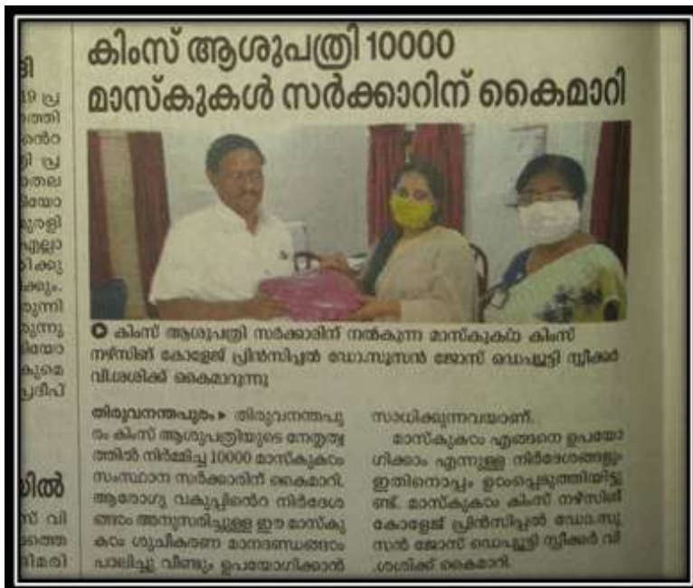
KIMS CON & Hospital Handed over 10,000 Cloth masks to State Government