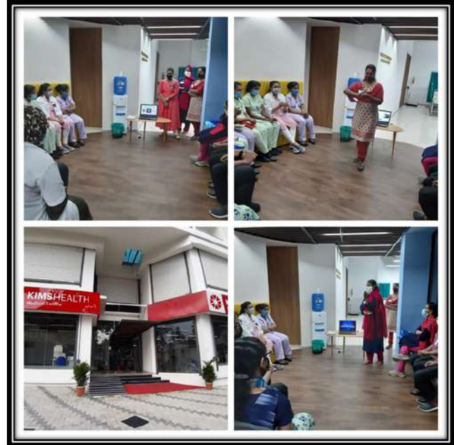
Health promotion awareness to KIMS wellness centre, Manacaud, Trivandrum