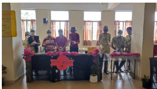
"HOT EAT, COLD TREAT 2022"

SNA unit of KIMS College of Nursing organized a fabulous food fest "HOT EAT, COLD TREAT 2022" as a fund rising venture on the eve of World OBESITY day.