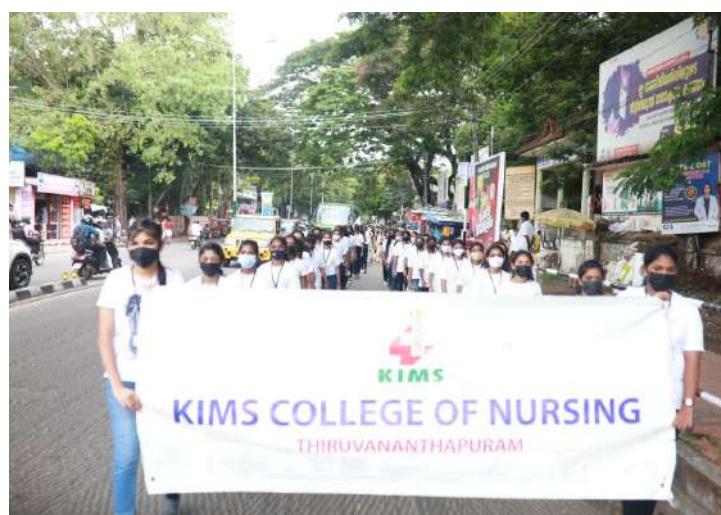
Overall championship on Nurses day celebration 2022