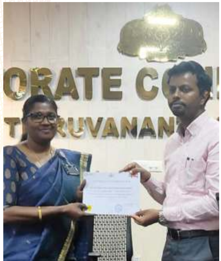
YIP - 7 TH RANK TO FACILLITATOR