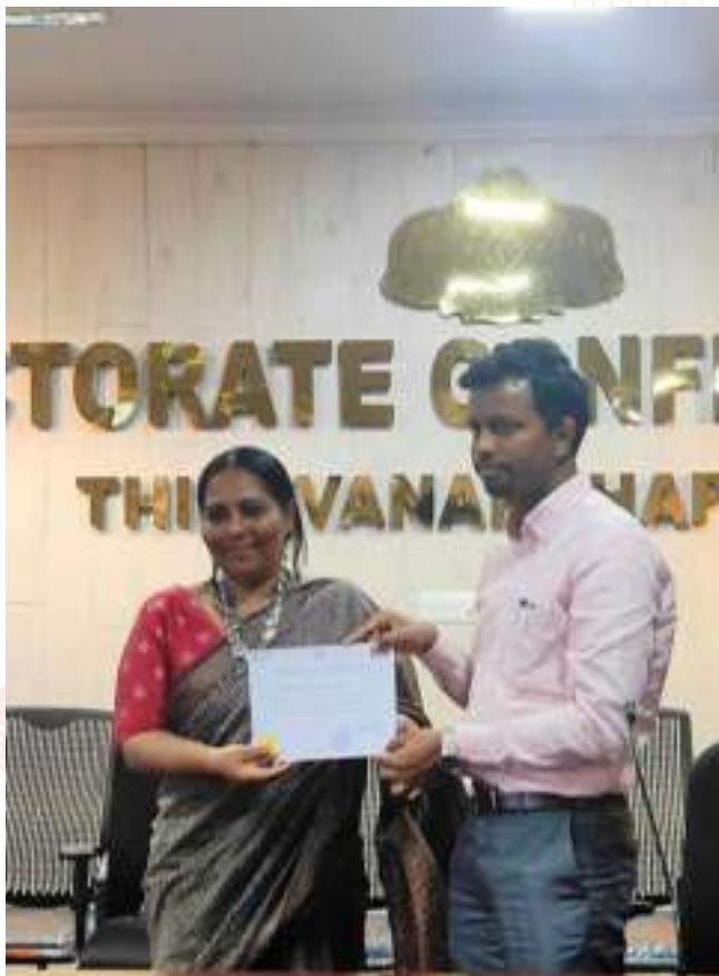
YIP - 6 TH RANK TO COLLEGE

Young Innovators Programme is a specially designed programme under Kerala Development and Innovation Strategic Council (K-DISC). The programme aims to empower future innovators to innovate new products, services or models to meet emerging requirements, unarticulated needs, or existing market needs of the society more effectively through an innovative challenge.