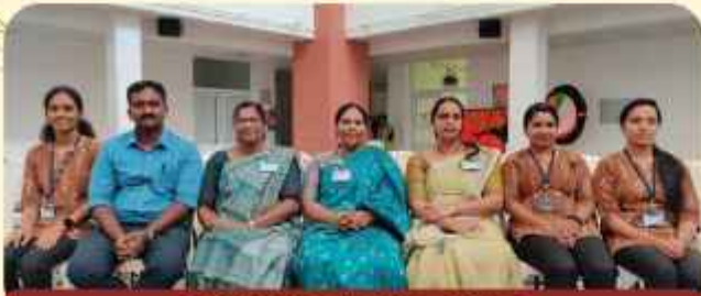
2ND YEAR M.Sc NURSING STUDENTS 12 TH BATCH (2021-2023)

“A GOOD SNAPSHOT..... STOPS A MOMENT FROM RUNNING AWAY.”