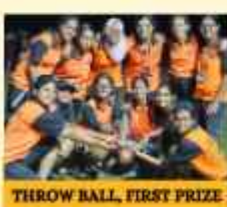
THROW BALL, FIRST PRIZE