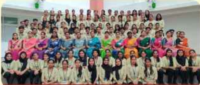
1ST SEM B.Sc NURSING STUDENTS 17 TH BATCH (2022-2026)