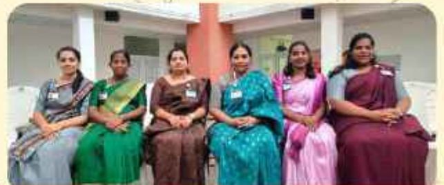
FACULTIES SCHOOL OF NURSING