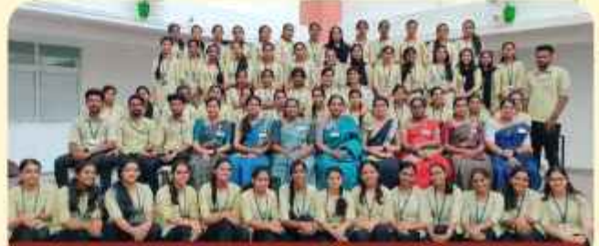
4TH YEAR B.Sc NURSING STUDENTS 11 TH BATCH (2019-2023)