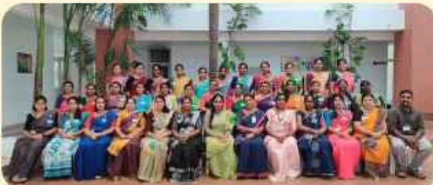
FACULTIES COLLEGE OF NURSING