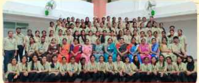
3RD SEM B.Sc NURSING STUDENTS 16 TH BATCH (2021-2025)