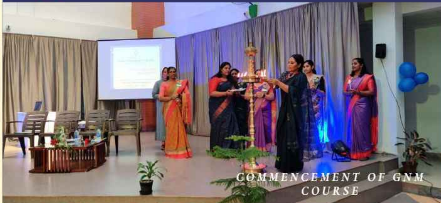
COMMENCEMENT OF GNM COURSE

BIANNUAL NEWSLETTER OF KIMS COLLEGE OF NURSING