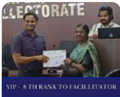
VIP - 8 TH RANK TO FACILITATOR