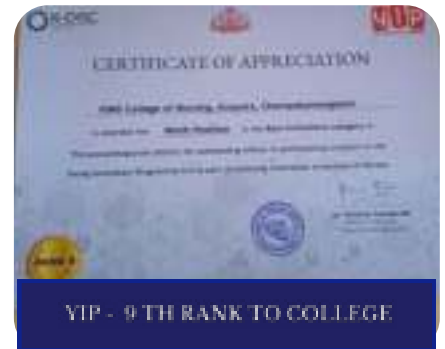
VIP - 9 TH RANK TO COLLEGE