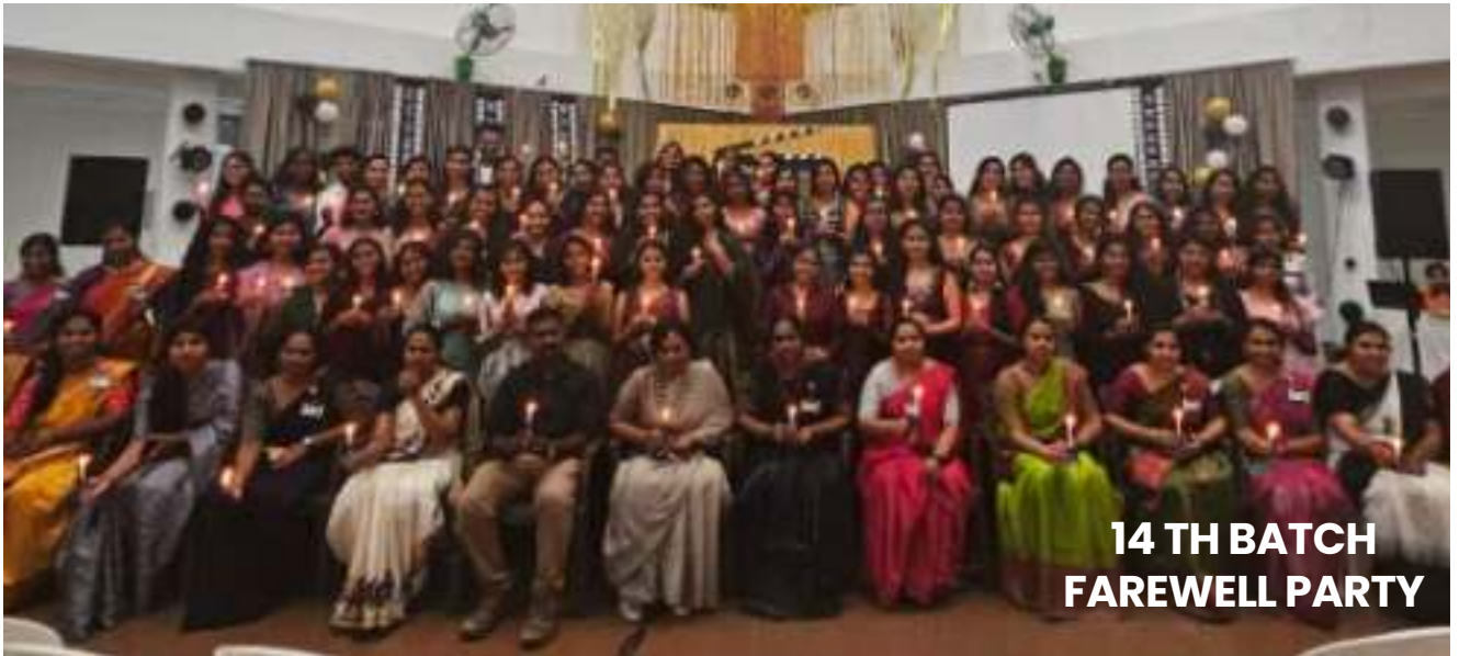
14 TH BATCH FAREWELL PARTY