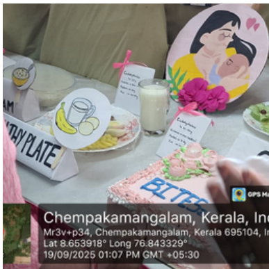
Chempakamangalam, Kerala, India Mr3v+p34, Chempakamangalam, Kerala 695104, India Lat 8.653918° Long 76.843329° 19/09/2025 01:07 PM GMT +05:30