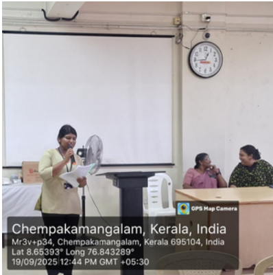
Chempakamangalam, Kerala, India Mr3v+p34, Chempakamangalam, Kerala 695104, India Lat 8.65393° Long 76.843289° 19/09/2025 12:44 PM GMT +05:30