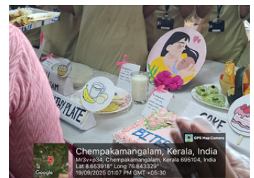
Chempakamangalam, Kerala, India Mr3v+p34, Chempakamangalam, Kerala 695104, India Lat 8.653918° Long 76.843329° 19/09/2025 01:07 PM GMT +05:30

Nutrition Fest - "KHANA" was held on 19/09/2025 for the 19th batch BSc Nursing and 2nd batch GNM students. The event highlighted the importance of balanced nutrition through active student participation and creative presentations, making it both educational and engaging.