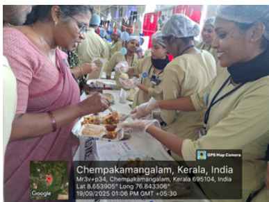
Chempakamangalam, Kerala, India Mr3v+p34, Chempakamangalam, Kerala 695104, India Lat 8.653905° Long 76.843306° 19/09/2025 01:06 PM GMT +05:30